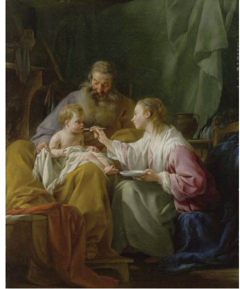
Noel Halle, Holy Family French, 1753 Hartford, Wadsworth Atheneum

Artists also began to depict a closer relationship between Jesus and his foster father. They were more frequently seen in close connection to each other. Joseph now carries and cares for the infant Jesus and teaches the boy Jesus.