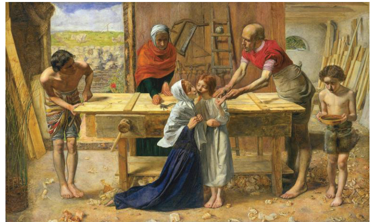
John Everett Millais, Christ in the House of His Parents English, 1849-50 London, Tate Britain